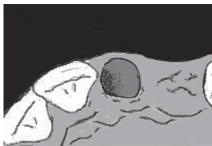
Fig. 5. Post-extraction socket