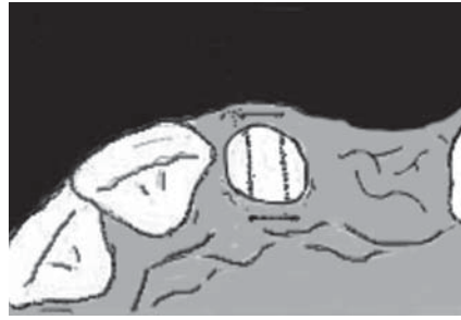
Fig. 8. Surgical suture stabilized collagen plug through soft tissues

adequate thickness of soft tissue covering the bone. Satisfactory parameters allow a specialist to place an implant in an ideal position in accordance with adjacent teeth. Because of above-mentioned extraalveolar and intraalveolar processes socket width and height changes are observed. Buccal bone surrounding the implant must be at least of 2 mm, so the vertical alveolar bone resorption would not progress. If after implantation buccal site thickness is less than 2 mm, vertical bone resorption is likely to occur [30, 31]. In addition, gingival biotype influences outlying outcomes of implantation as well [25]. There is a need to preserve or even increase the hard and soft tissue using a simpler, less damaging and costly interventions, reducing the number of visits [13]. These set requirements provide importance to preservation procedure of marginal alveolar bone ridge during a tooth extraction, which often reduce and sometimes eliminate the need for subsequent augmentation procedures [13, 25]. During immediate implantation, these procedures help to maintain the alveolar bone ridge and gingival anatomy. If there is a need of additional augmentation procedures before implant placement then preservation and augmentation procedures of extraction socket at the time of tooth removal is an important preparatory stage, which increases the success of the later augmentation.