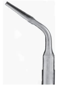
Fig. 3. Piezo ultrasonic tip

be divided into: anatomical, prosthetic, functional, and metabolic [3, 4].