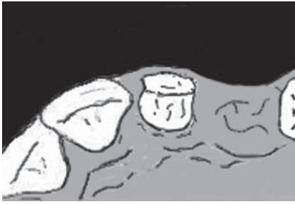
Fig. 7. Collagen plug placed over the bone graft