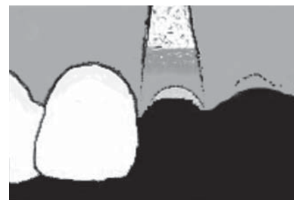
Fig. 6. Bone graft packed to the alveolar pit limit

impacted wisdom tooth or tooth when will not be inserted dental implant). This exception can be applied only if the assessment concludes that the risk of fragments retrieval is greater than non-removal from alveolar socket [22]. Absolute requirements: fragments of less than 4-5 mm deep in the bone, non-infected. It is believed that such fragments can be encapsulated or resorbed. Any left fragments or other infections causing debris can not be left in the space of implantation.