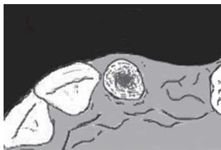
Fig. 4. Dental root Nr. 22 must be extracted due to poor conservative treatment prognosis